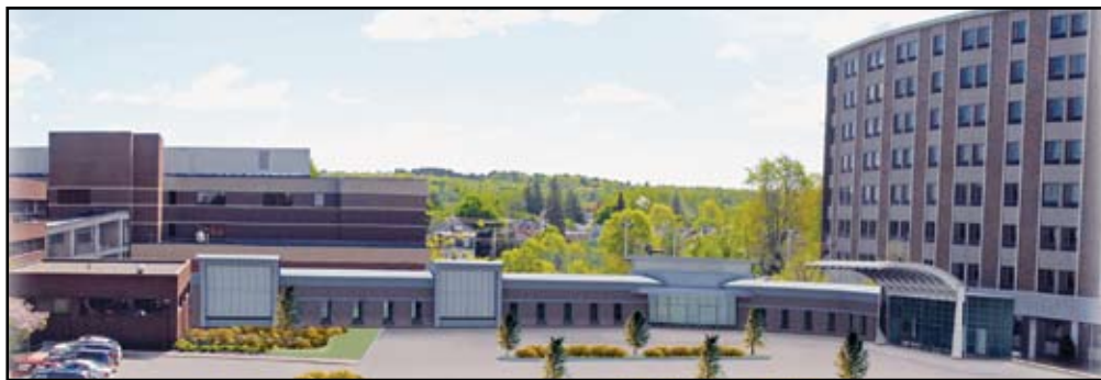
Rendering of the connecting corridor.

In October, Samaritan Medical Center broke ground on its newest construction project - an enclosed connecting corridor that will link Samaritan Medical Center with Samaritan Keep Home. This two-level corridor will allow for the movement of residents between the nursing home and hospital and will eliminate the current need to transfer nursing home residents to the hospital by ambulance.